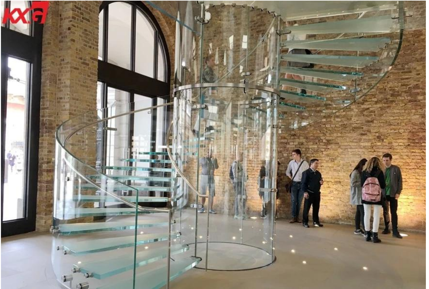
KXG Glass CE certified 17.52mm low iron toughened laminated safety glass factory