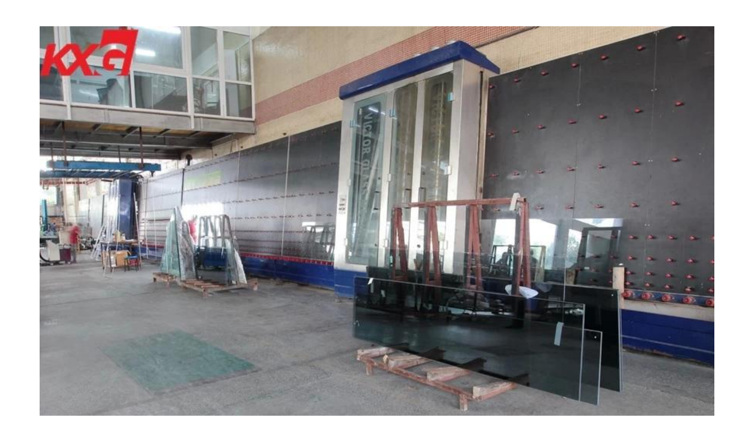
The packaging of 6+12A+6 clear tempered insulated glass