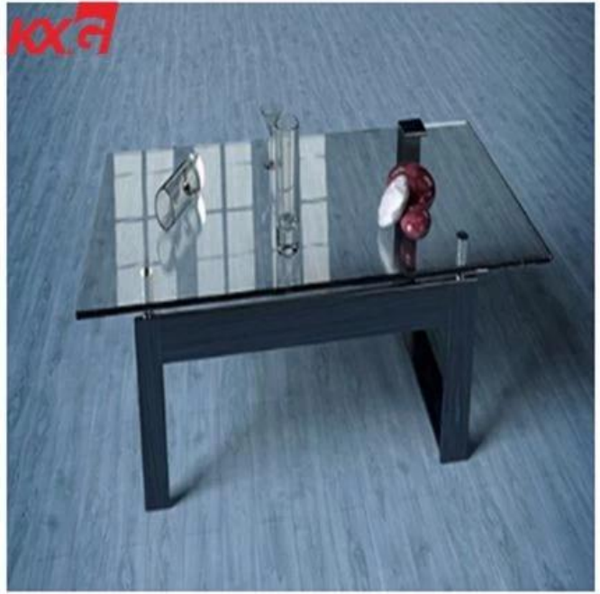
Table Top Glass Packing in KXG