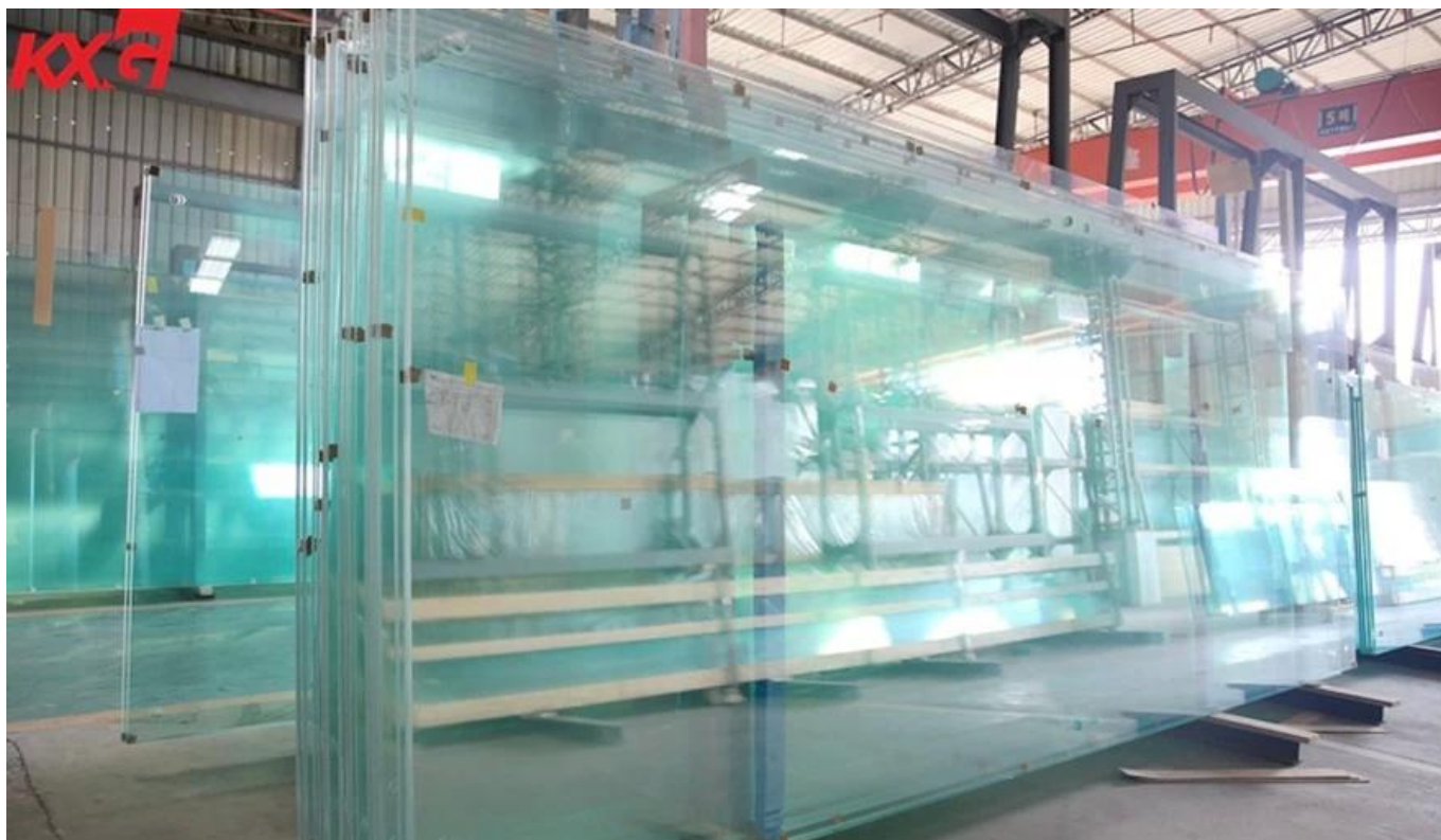
KXG heat strengthened glass production line