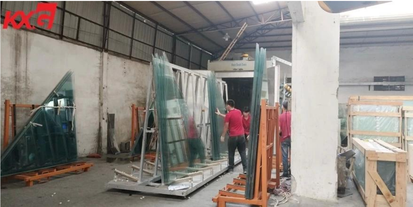
11,52 □ XXXXXX XXXXXXX laminated XXXXXX XXXXXX XXXXXX XXXXXXXXXXX XXXXXXX □□ Kunxing □□ XXXX □□□□□□ □□□□□□□□

XXXXXXXXXXXXXXXXXXXXXXXXXXXXXXXXXXXXXXXXXXXX