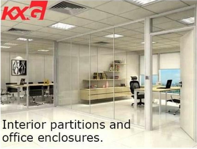
Interior partitions and office enclosures.