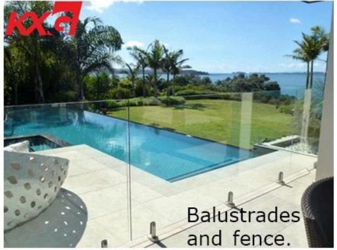
Balustrades and fence.