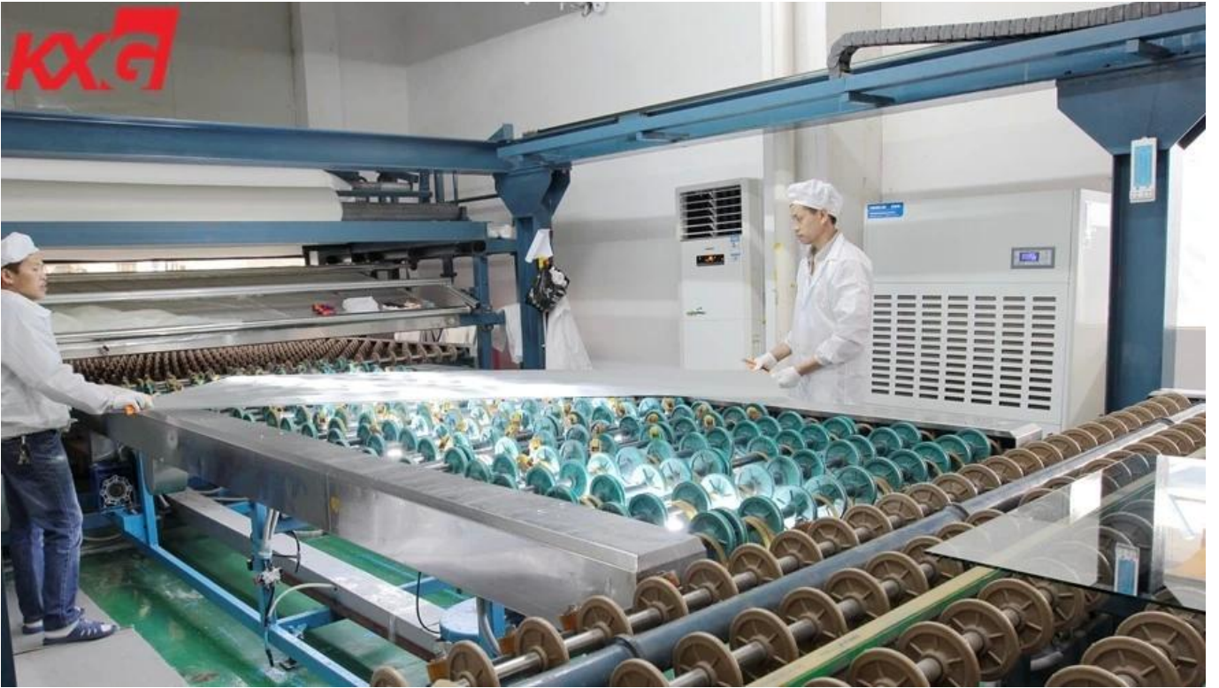
21.52 low iron tempered laminated glass packing