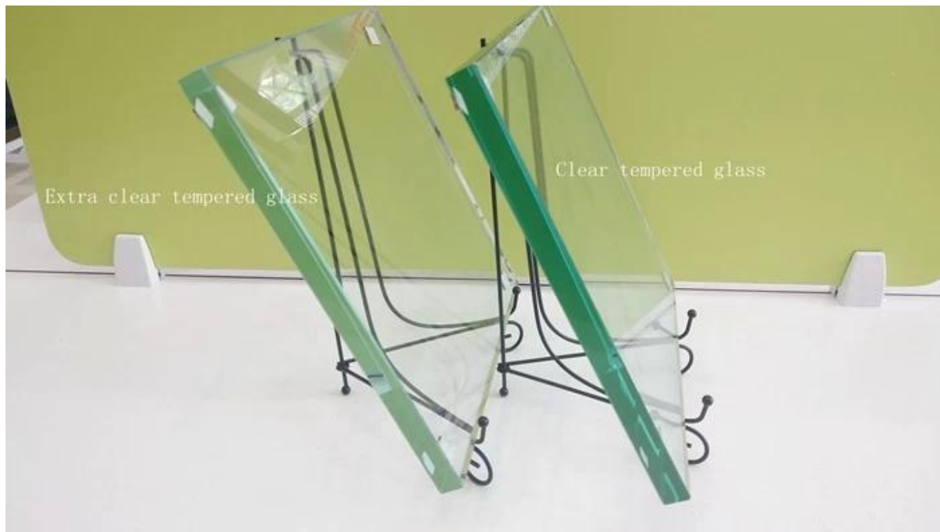
6mm Extra clear tempered glass packing