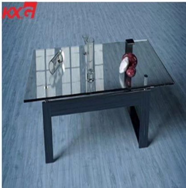
Table Top Glass Packing in KXG