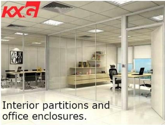
Interior partitions and office enclosures.