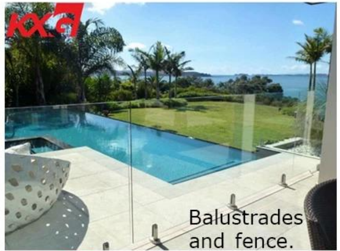
Balustrades and fence.