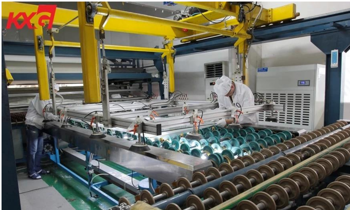
6mm+0.76mm PVB+6mm clear tempered laminating glass stay autoclave 8 hours