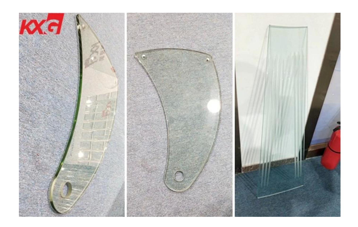
Thickness 8+8+8mm 10+10+10mm 12+12+12mm 15+15+15mm

The type of glass:Clear tempered laminated glass, silk screen laminated glass, tinted laminated glass, Acid etched laminated glass, special processed anti-slip laminated glass.