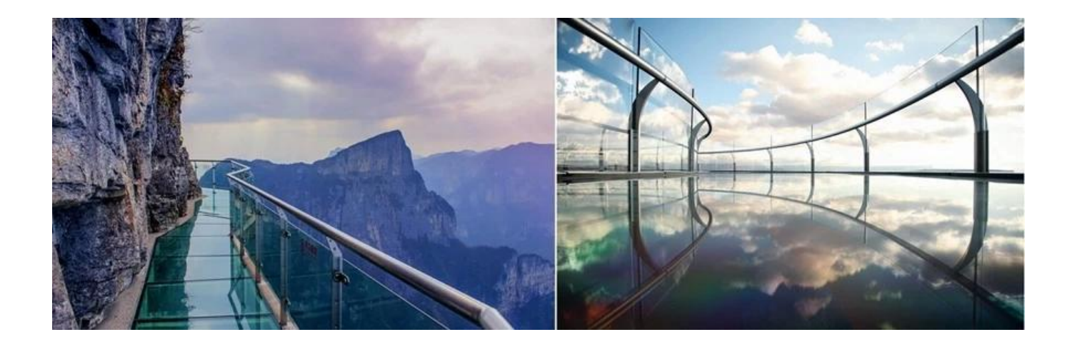
KXG anti slip safety laminated structural stair treads and floor glass