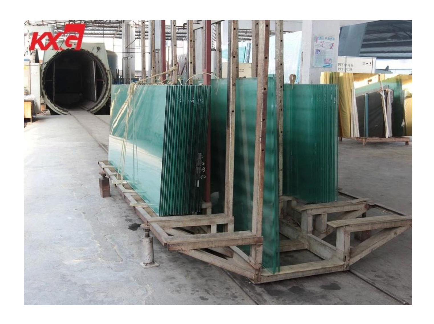
Safety laminated structural stair treads and floor glass