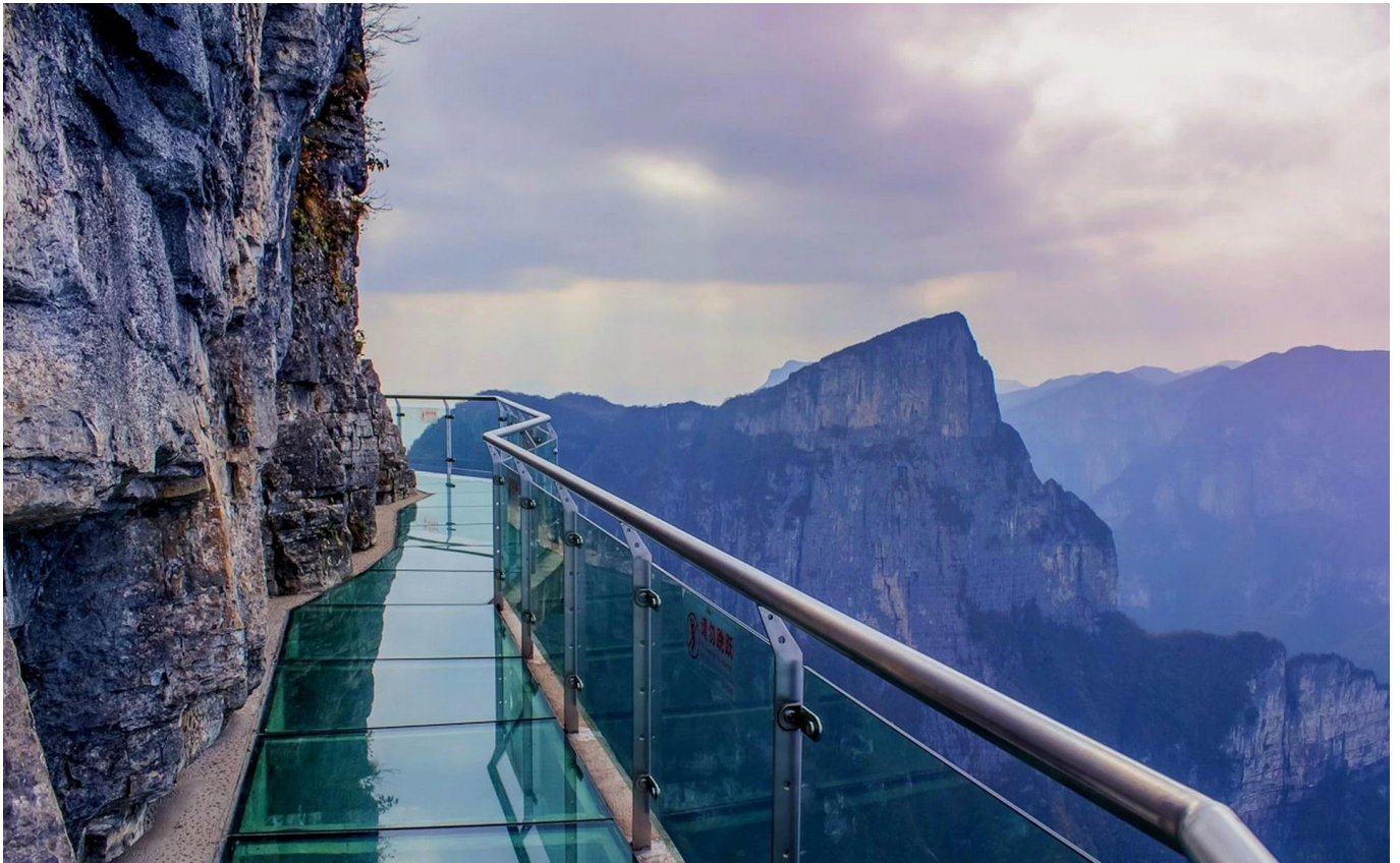
15+1.52mm+15mm Tempered Laminated Glass Producing at KXG factory workshop