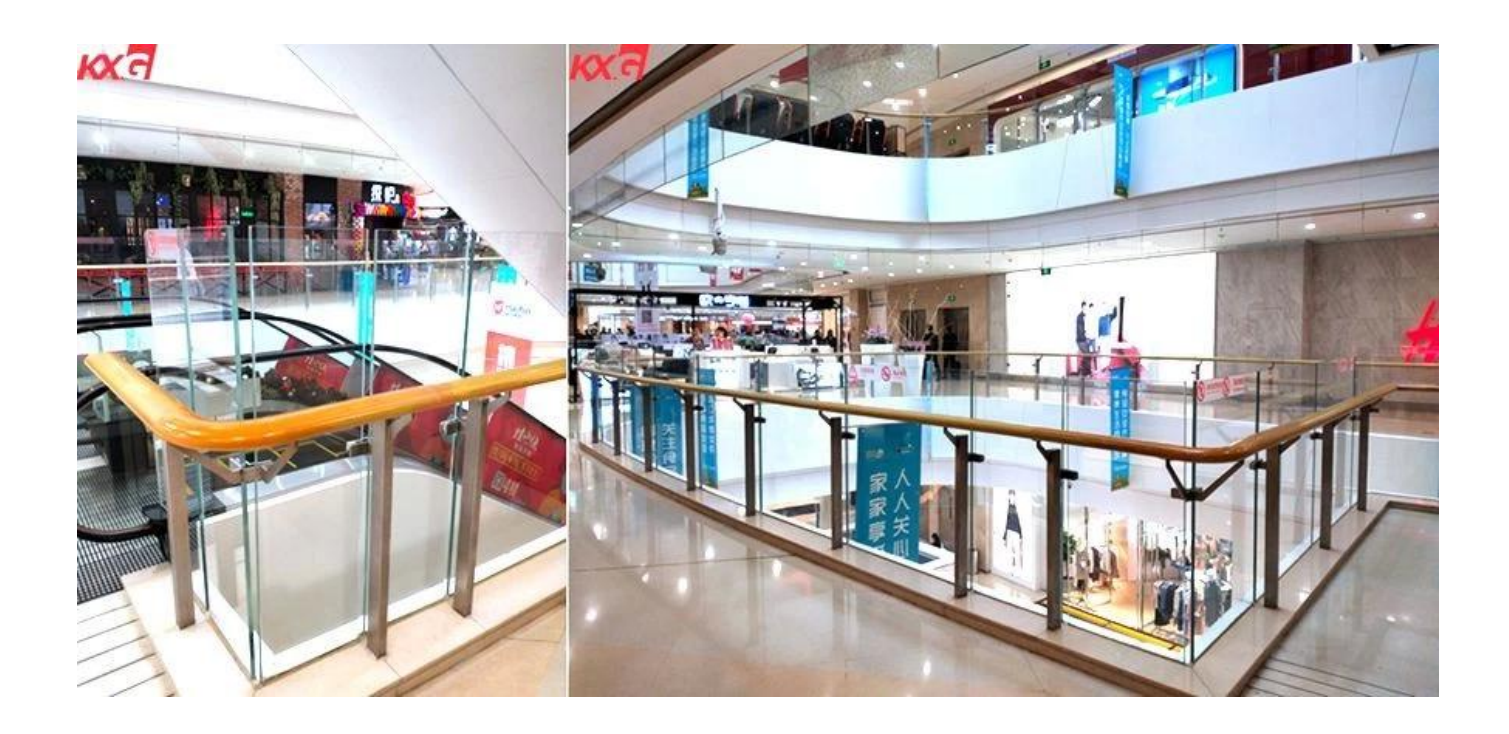
KXG Laminated Glass Machine