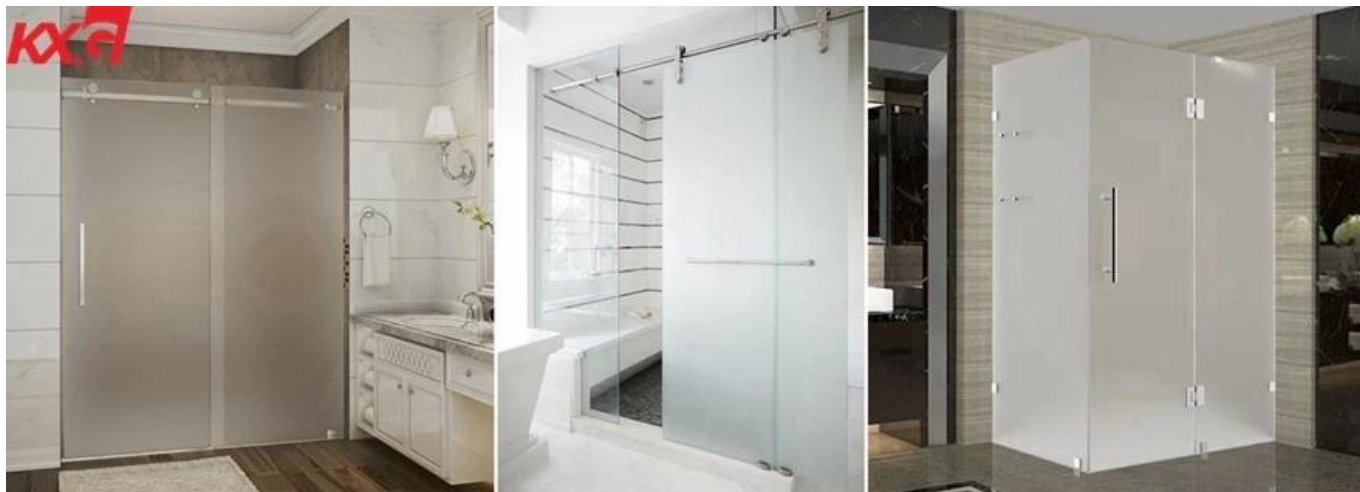
KXG frosted tempered laminated glass workshop